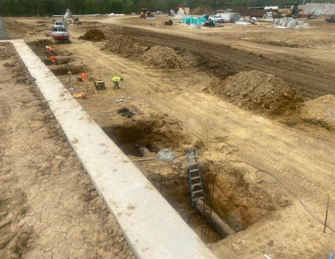
East stadium piers for bleachers