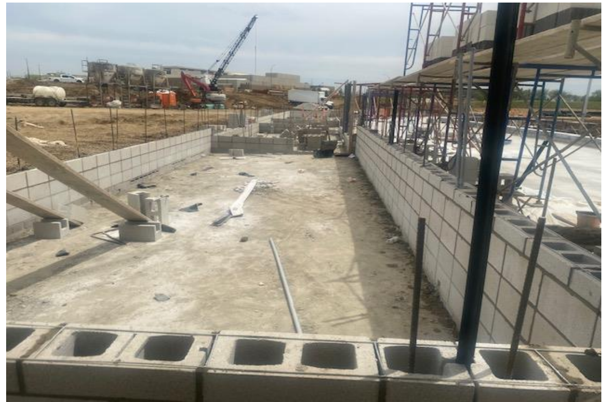
North concourse looking east