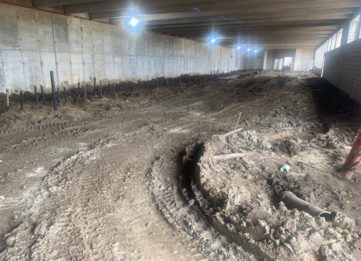
Lower-level locker room and storage under north concourse