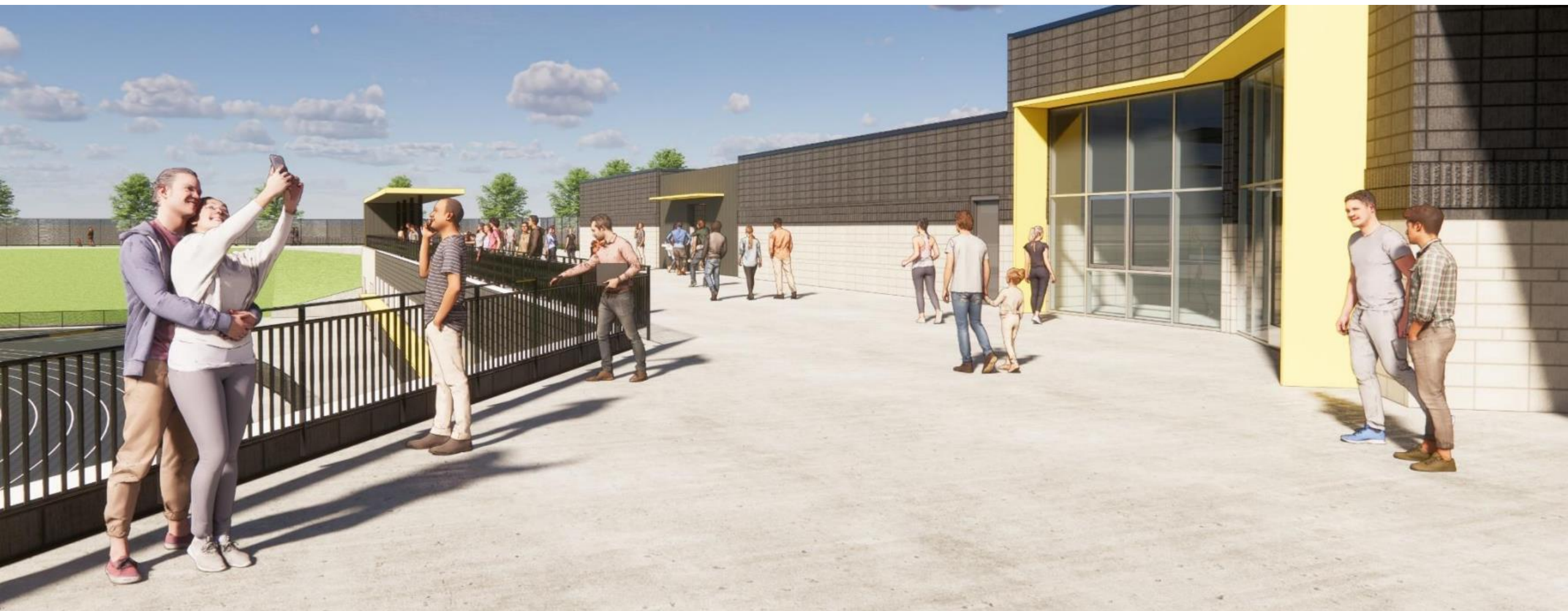
North concourse looking west