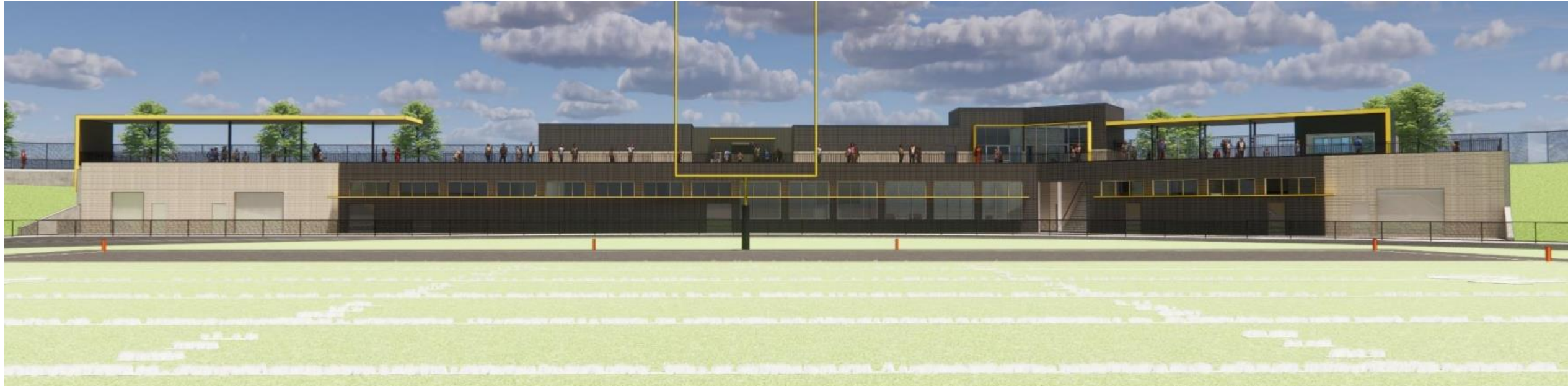
Rendering of North building