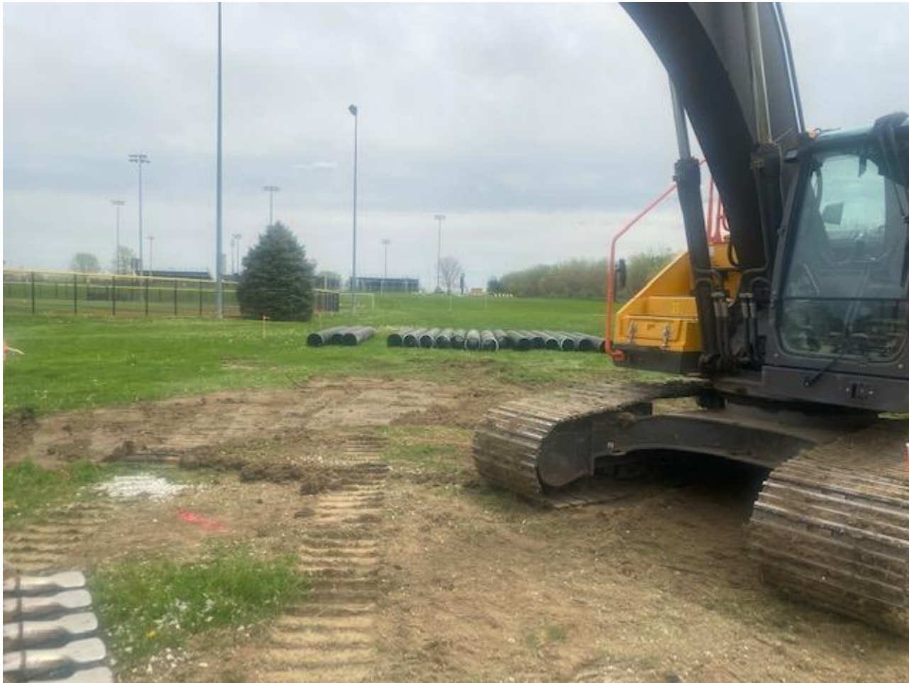
Storm sewer work started west of baseball diamond